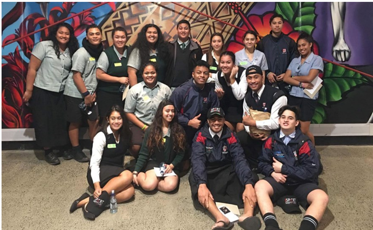
Above: Papakura High School and Rosehill College students of The Rising Foundation