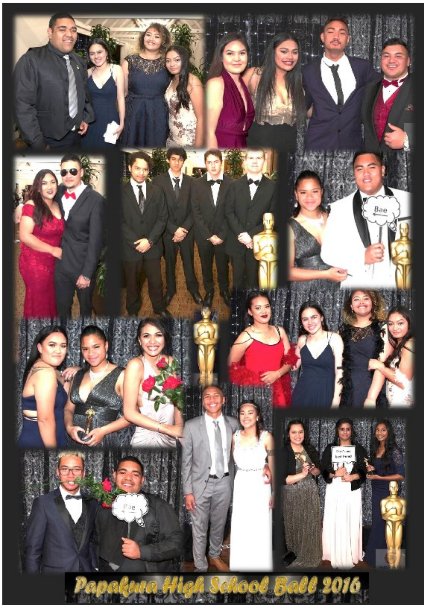
Papakura High School Ball 2016