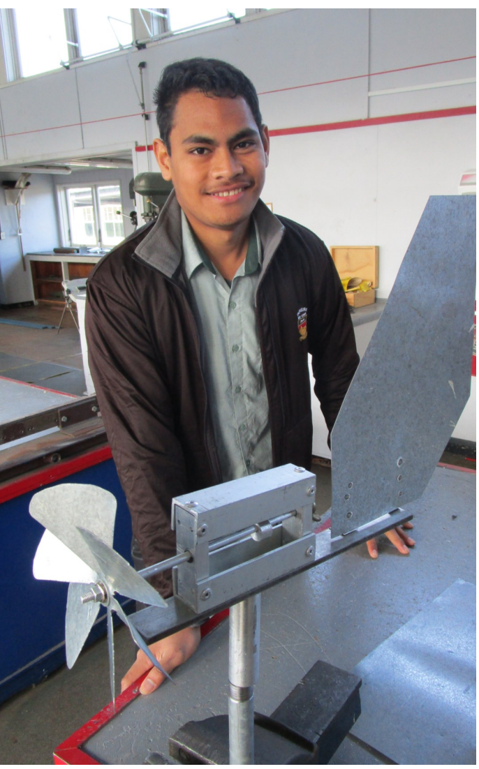
Pictured above left to right above and bottom left: