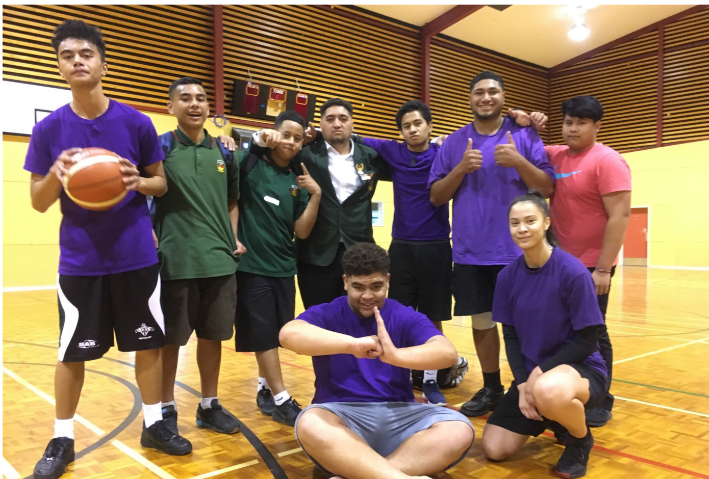
Above: Congratulations to Otuuwairoa Whanau for taking out Whanau Basketball on Thursday 21 June 2018