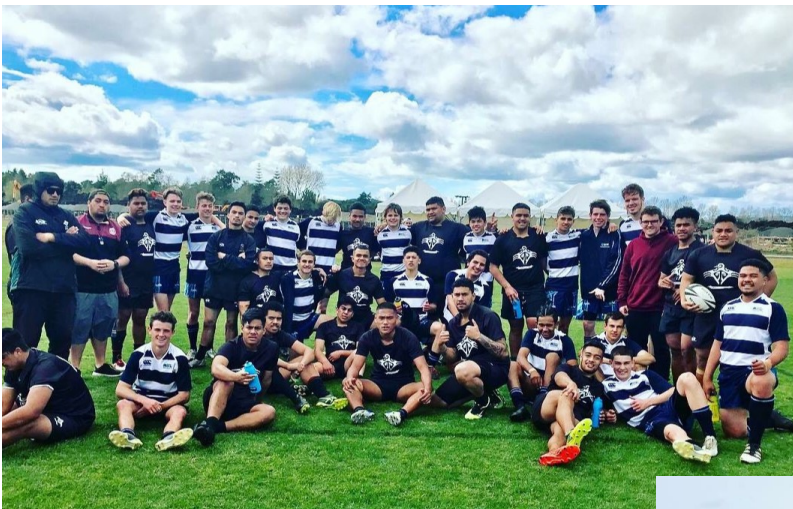
Our 1st XIII together with Whangaparaoa College