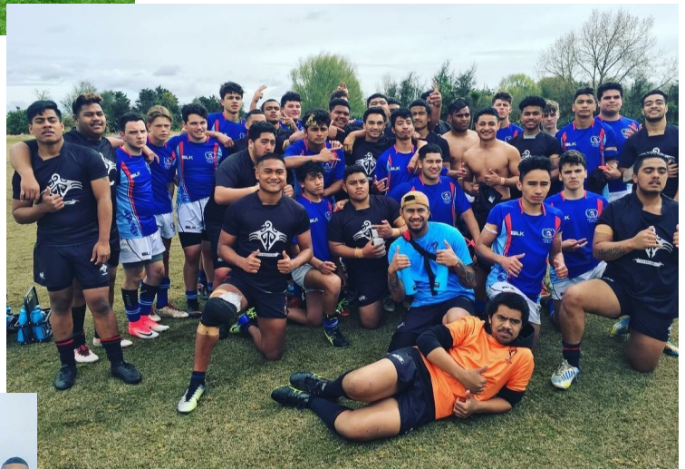
Papakura High School with Manawatu College