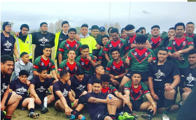
Onehunga High School and Papakura High School