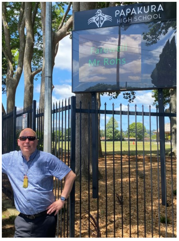
Last time leaving the school gates

Visit our website www.papakurahigh.school.nz