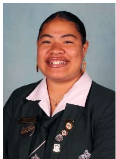
Hola Poteki (also BOT representative)